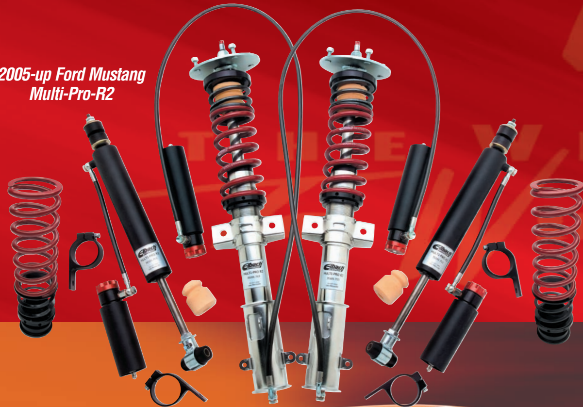
2005-up Ford Mustang Multi-Pro-R2

The Eibach parts we make to give your Mustang its winning edge are made with the same top-quality materials, painstaking craftsmanship, and bulletproof durability that took all those drivers to victory. To learn more—visit Eibach.com and take a high-speed tour inside Eibach USA.