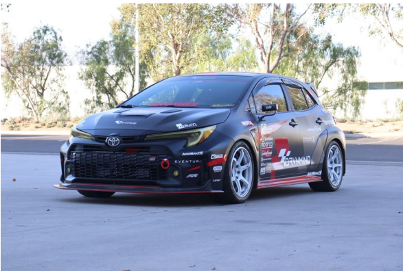
Road test the vehicle and double check that everything is tight.