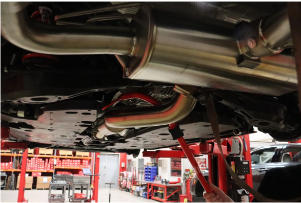
Install the Eibach sway bar. You will reuse the OE brackets and hardware.