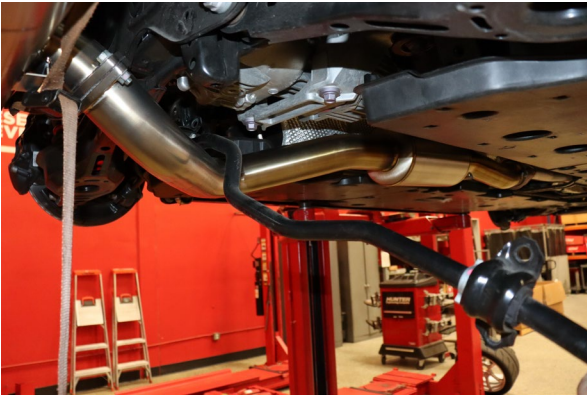
Remove the OE sway bar.