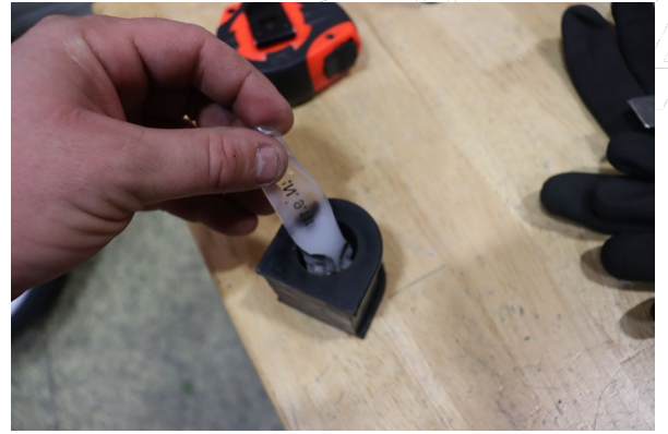
Lubricate the provided bushings and install bushings on the sway bar.