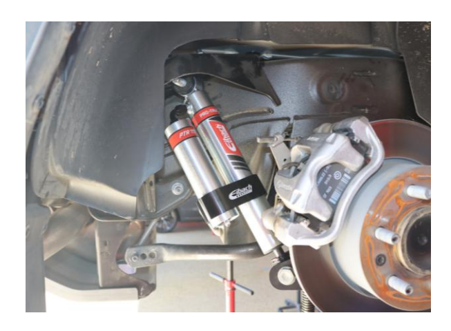
Reservoir should be mounted at the top. The Eibach logo is pointing toward the tire on both side of the vehicle.