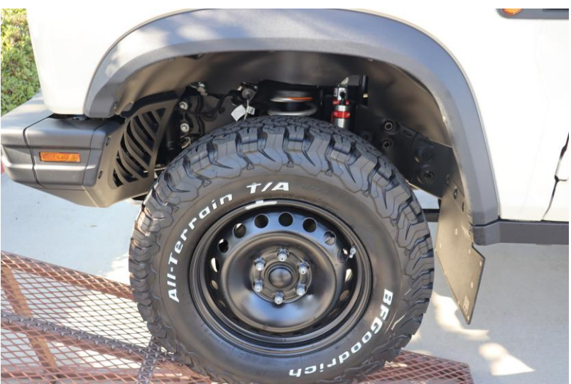
Reservoir should be mounted at the top and pointing toward the tire on both side of the vehicle.